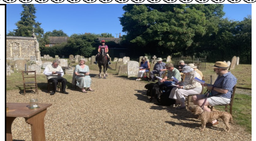
PET SERVICE. JULY 18th 2024

The Food Bank is in urgent need of more contributions. These can be left in the box in Wissett Church or in St Mary's Church Halesworth for distribution locally. The box in the church is emptied daily. Dry and tinned goods are best. If you are in need go to Halesworth Church Hall on Wednesdays, 10.30 to 11.30.