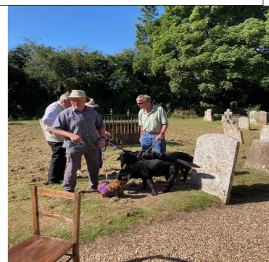
SOME PARTICIPANTS AT THE PET SERVICE. ST ANDREW'S CHURCH WISSETT JULY 28th 2024